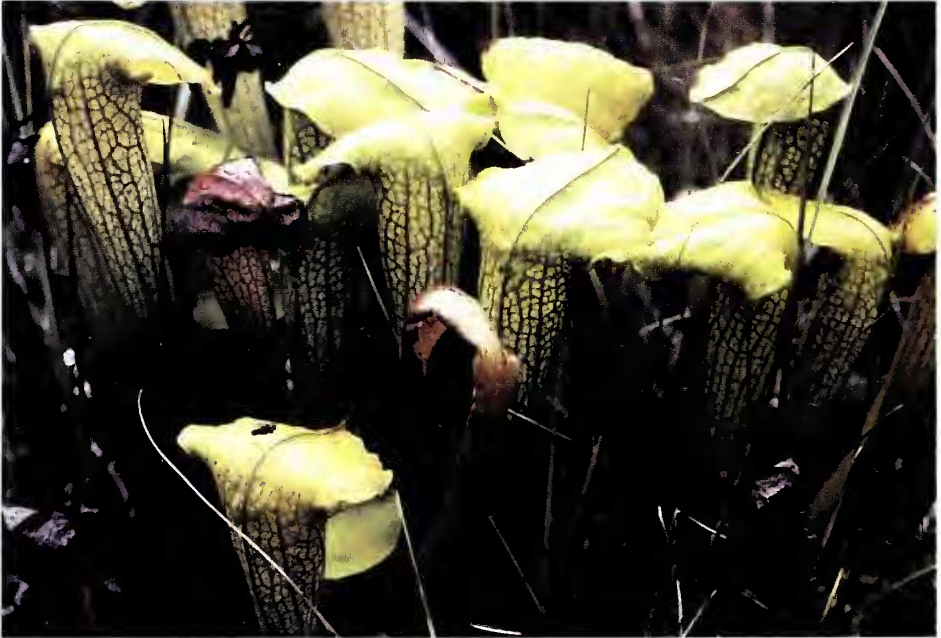
Figure 2: Sarracenia 'Hummer's Hammerhead'